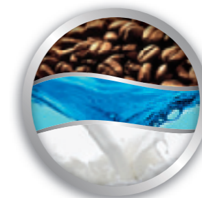
Saeco Fresh Taste Experience